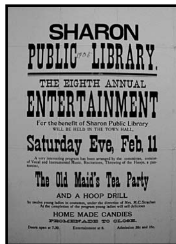
Poster on display at the Sharon Historical Society circa 1905.

and activities in Sharon that always welcome fresh volunteer energy: drivers for Stagecoach Transportation to help folks get to senior center meals or doctor's appointments, Green-up Committee, Sharon Fire Department and the Firemen's Association, people to care for all the historic town cemeteries, activity leaders for boy and girl scouts, Sharon Planning Commission, White River Task Force, Sharon Food Shelf, Community Meals, Sharon Emergency Planning Committee, Up-n-Downers Snowmobile Club, and Sharon Conservation Committee, and last but not least - contributing to this newsletter! If you would like to learn more about any of these opportunities to put your talents and energy to work please send an inquiry to the sharonconnectionsnewsletter@gmail.com or call the town office at 763-8268 to get names and telephone numbers for the groups of interest to you.