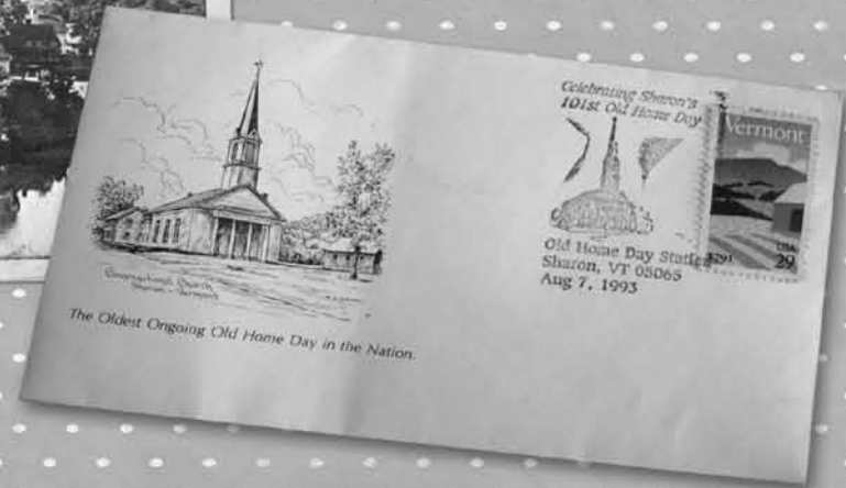
This envelope which is on display at the Sharon Historical Society shows the 101 st Old Home Day stamp. Sharon is also named "The Oldest Ongoing Old Home Day in the nation."